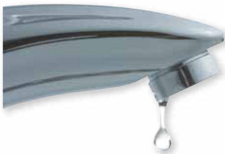
Drop of water: 50^{-2} L

A drop of water leaks from a faucet every second. How many liters of water leak from the faucet in 1 hour?