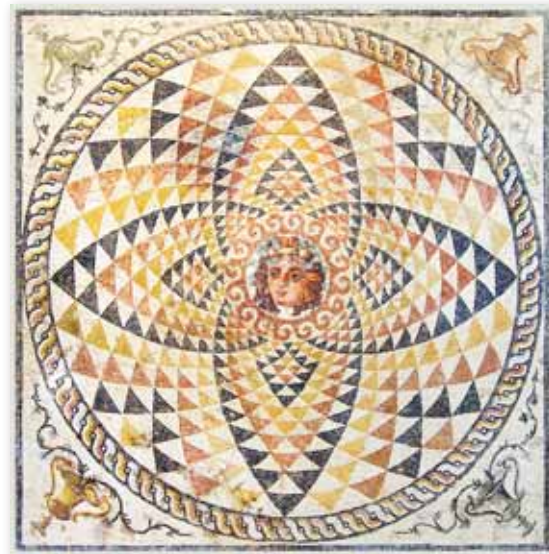
Ancient Roman Mosaic