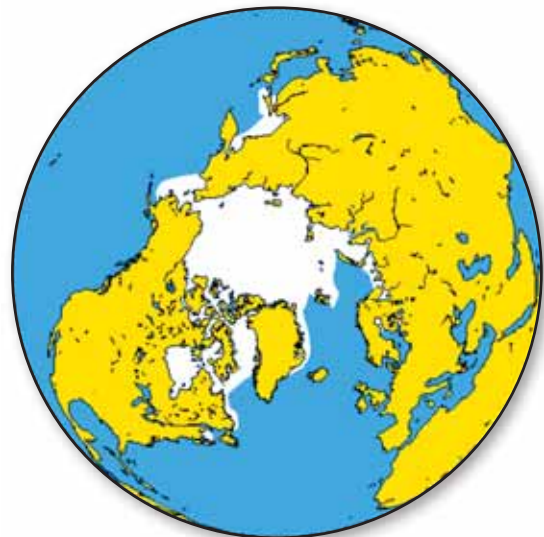
Earth's North Polar Ice Cap