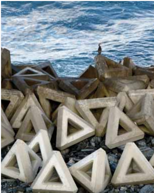
Concrete Tetrahedrons by Ocean