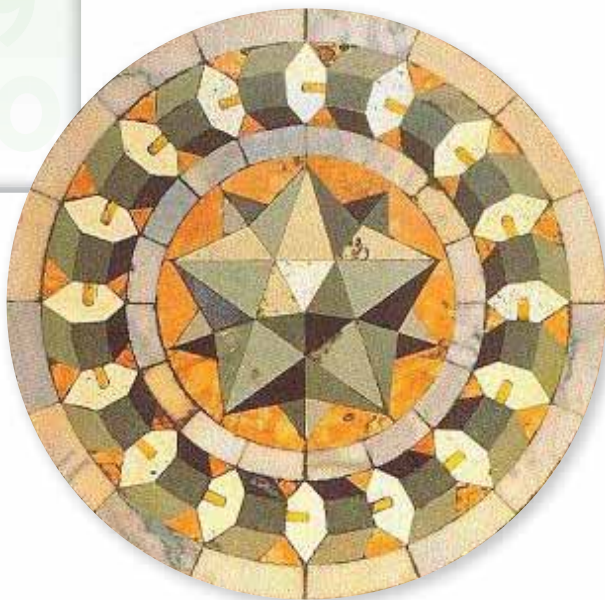
Mosaic by Paolo Uccello, 1430 A.D.

Sample: Three of the Platonic solids have faces that are equilateral triangles. One of these is the octahedron. Here is a net for an octahedron.