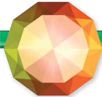
Faceted Cut Gem