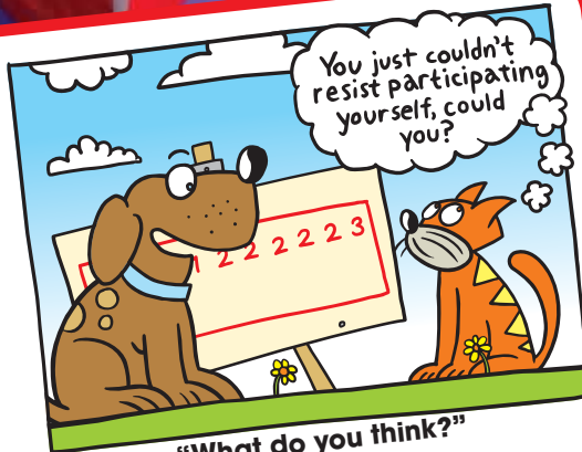
"What do you think?"