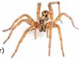
Spider Phylum: Arthropoda Class: Arachnida Order: Araneae (spider)