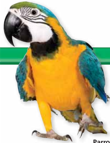
Parrot Phylum: Chordata Class: Aves Order: Psittaciformes (strong, curved bill)