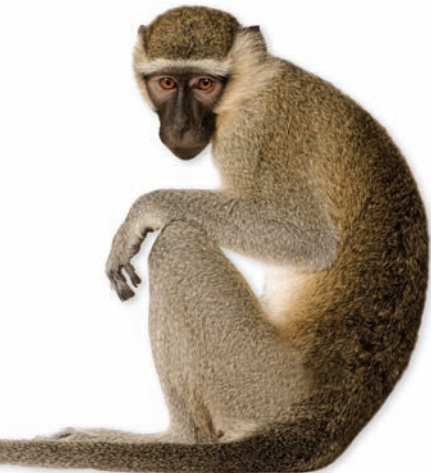
Monkey Phylum: Chordata Class: Mammalia Order: Primate (large brain)