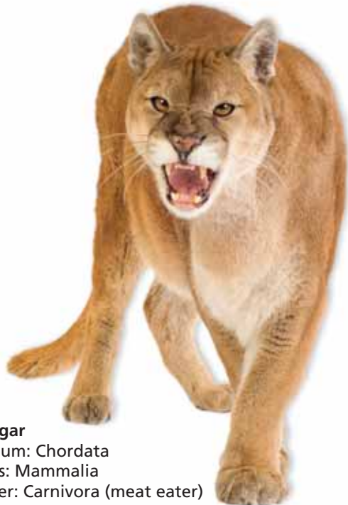
Cougar Phylum: Chordata Class: Mammalia Order: Carnivora (meat eater)