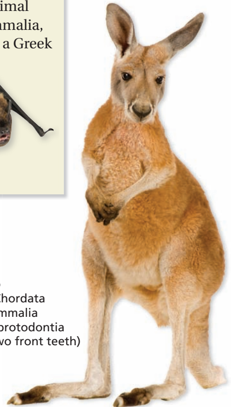
Kangaroo Phylum: Chordata Class: Mammalia Order: Diprotodontia (two front teeth)