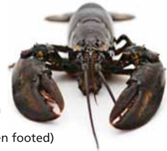
Lobster Phylum: Arthropoda Class: Malacostraca Order: Decapoda (ten footed)