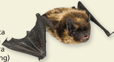
Bat Phylum: Chordata Class: Mammalia Order: Chiroptera (hand-wing)

Sample: A bat is classified as an animal in the phylum Chordata, class Mammalia, and order Chiroptera. Chiroptera is a Greek word meaning “hand-wing.”