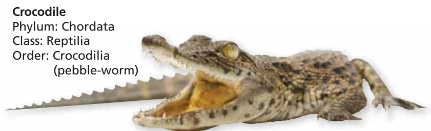
Crocodile Phylum: Chordata Class: Reptilia Order: Crocodylia (pebble-worm)