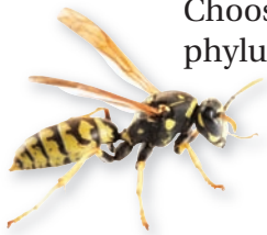
Wasp Phylum: Arthropoda Class: Insecta Order: Hymenoptera (membranous wing)

Sample: A bat is classified as an animal in the phylum Chordata, class Mammalia, and order Chiroptera. Chiroptera is a Greek word meaning “hand-wing.”