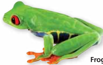
Frog Phylum: Chordata Class: Amphibia Order: Anura (no tail)