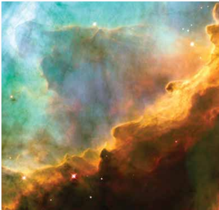
Hubble Image of Space